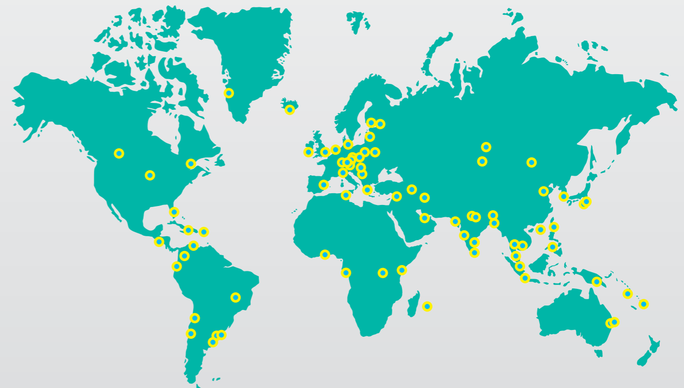
MAP OF RIR-OPERATED OR SUPPORTED ROOT NAME SERVER INSTANCES

For more information about root name servers, please see root-servers.org