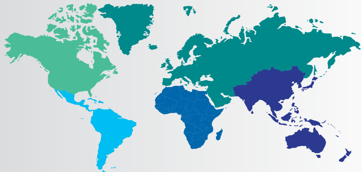
ARIN, serving Canada, many Caribbean and North Atlantic Islands, and the United States

The RIRs are responsible for the regional management of Internet number resources. Together, the RIRs formed the NRO to serve as a coordinating body, providing global industry partners with a single point of contact. Each RIR community manages Internet number resources according to established, bottom-up, community-developed technical and operational policies, and works with the other RIR communities on policies that require global coordination.