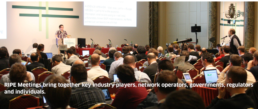
RIPE Meetings bring together key industry players, network operators, governments, regulators and individuals.

This information sheet is current as of 6 January, 2011.