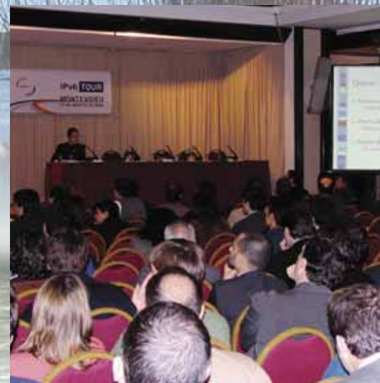
LACNIC's "IPv6 Tour", a series of short events aimed at promoting the adoption of IPv6 address space in the LACNIC region. During 2005, the program reached a total of 2522 attendees in 10 countries.